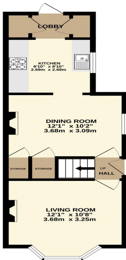
GROUND FLOOR 409 sq.ft. (38.0 sq.m.) approx.